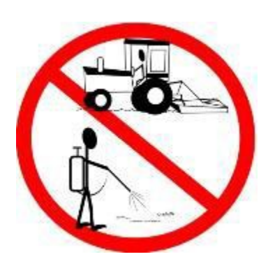
PLANT PROTECTION NO MOWING/NO SPRAYING SP-04315 24" X 24"